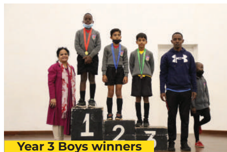
Year 3 Boys winners