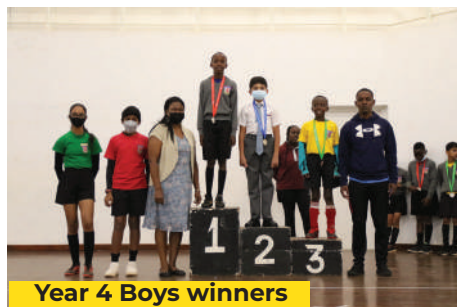
Year 4 Boys winners