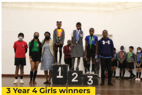
3 Year 4 Girls winners