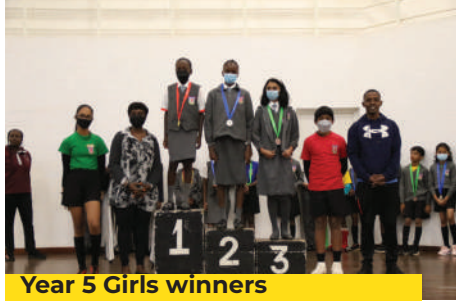
Year 5 Girls winners