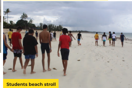
Students beach stroll