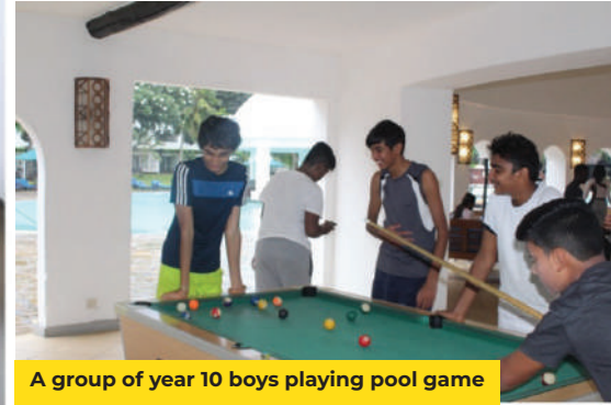
A group of year 10 boys playing pool game