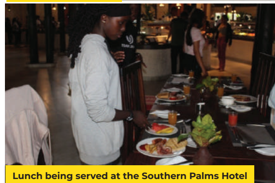
Lunch being served at the Southern Palms Hotel