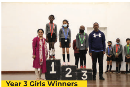
Year 3 Girls Winners