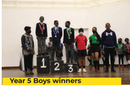
Year 5 Boys winners