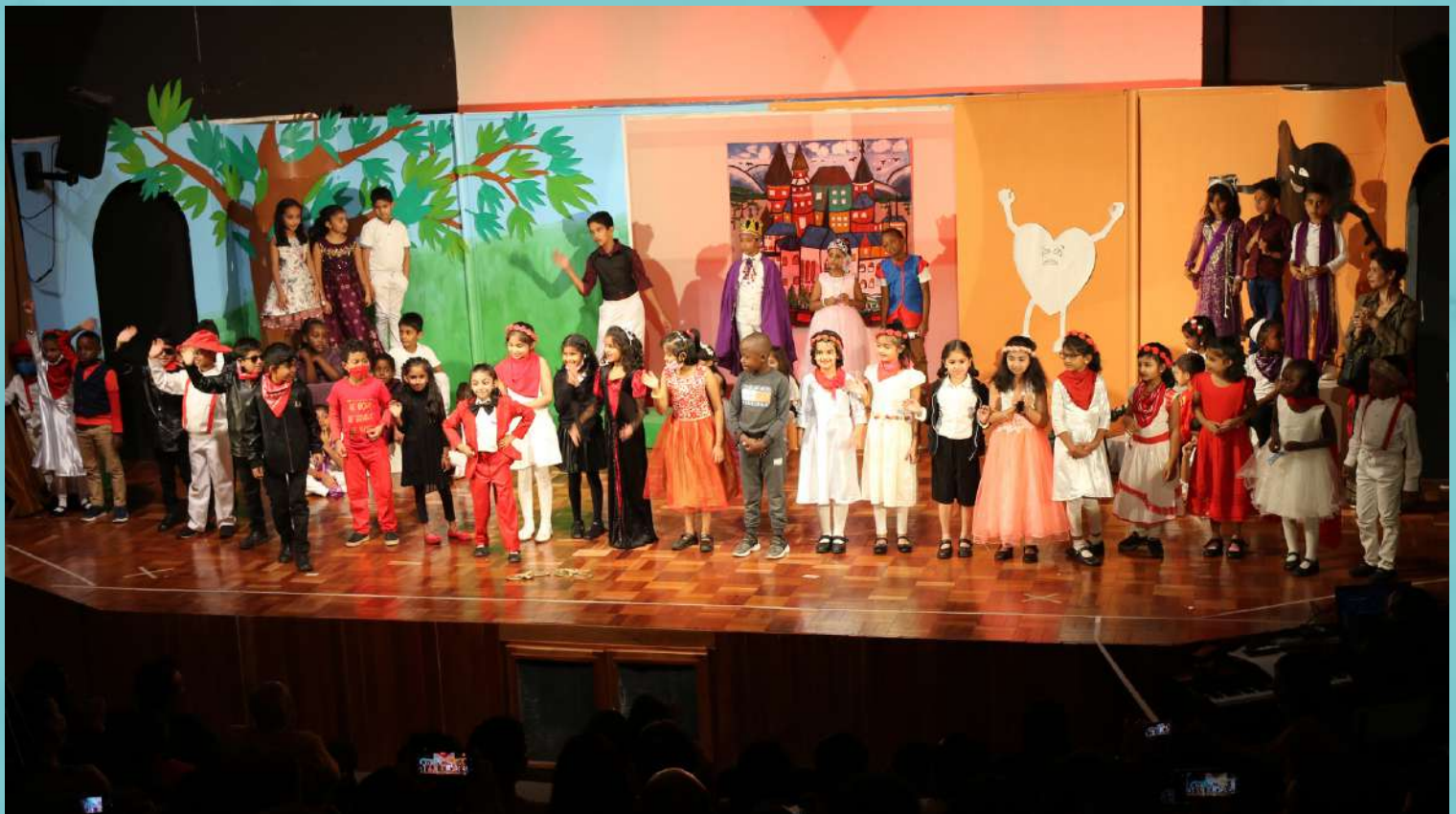
Year 2 learners during the play.

The audience applauded each scene of the presentation.