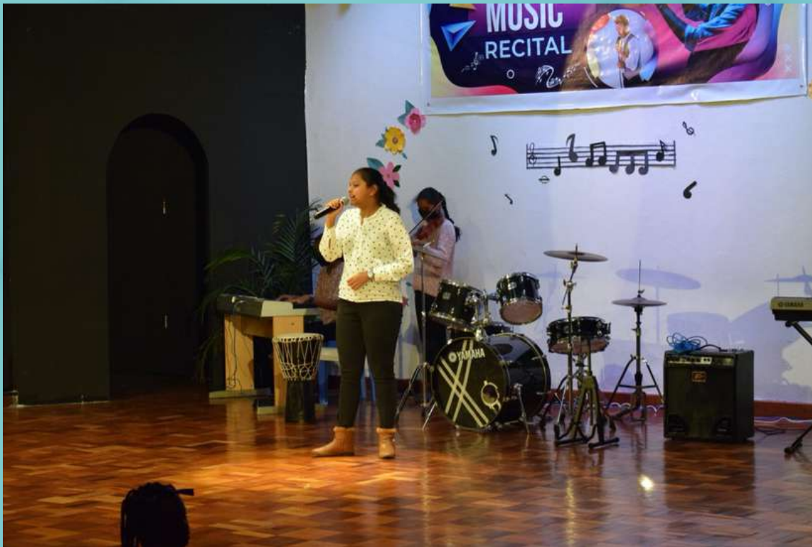
Our very own student singing her heart out during the 2022 Annual Music Recital.

The music recital is an interschool music buffet where students get to showcase their musical skills and prowess by showcasing various pieces of creative performances ranging from voice, instruments, dance and poetry in from of short musicals.