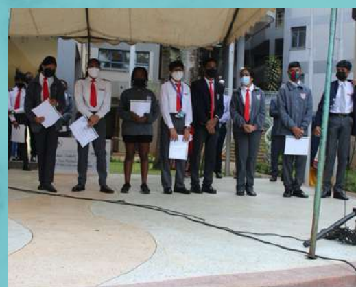
Welcoming new officials of Science fair committee 2022.

We are happy to inform you that Oshwal Junior High Science fair will take place in term 3. This event is the most exciting day on which students and teachers come together to celebrate innovative ideas. The main purpose of organizing a science fair is to arouse the interest of the students. We appreciated the efforts of our last year's officials and presented them with certificates. We would like to thank them for their immense enthusiasm shown during the event. Science fair committee welcomes new officials for the year 2021-2022.