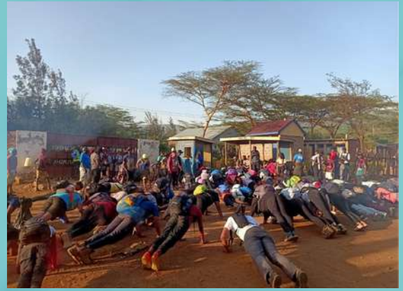
Our PA students warming up before their hike at Mount Longonot in Kijabe.

The 11th of February was the highlight of the expedition. The participants engaged in light morning exercises to awaken the muscles before the hike.