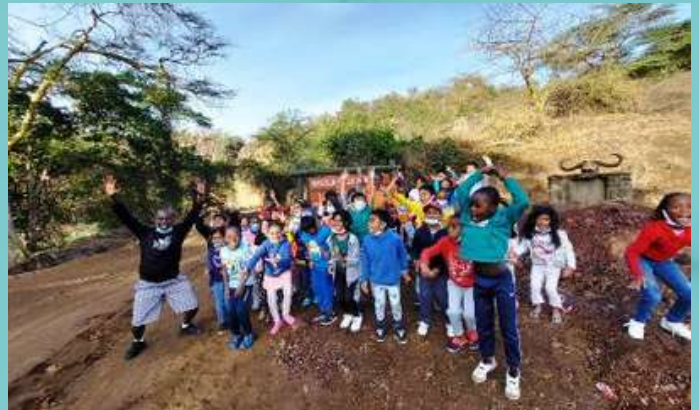
Year 2 learners during Sarova game Lodge Trip.