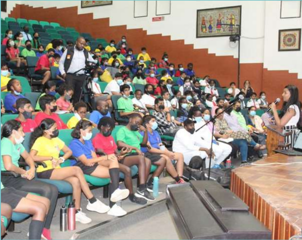
Year 6 students from our primary section keenly listening to a speaker in readiness for Junior High.

Oshwal Academy Nairobi runs from nursery all the way to college. It is possible and highly advisable for students to consistently study at our schools so that we can understand their history, needs and monitor their growth and development. In our earnest endeavour to do so, we are always keen on how we manage the transition from one school to another.