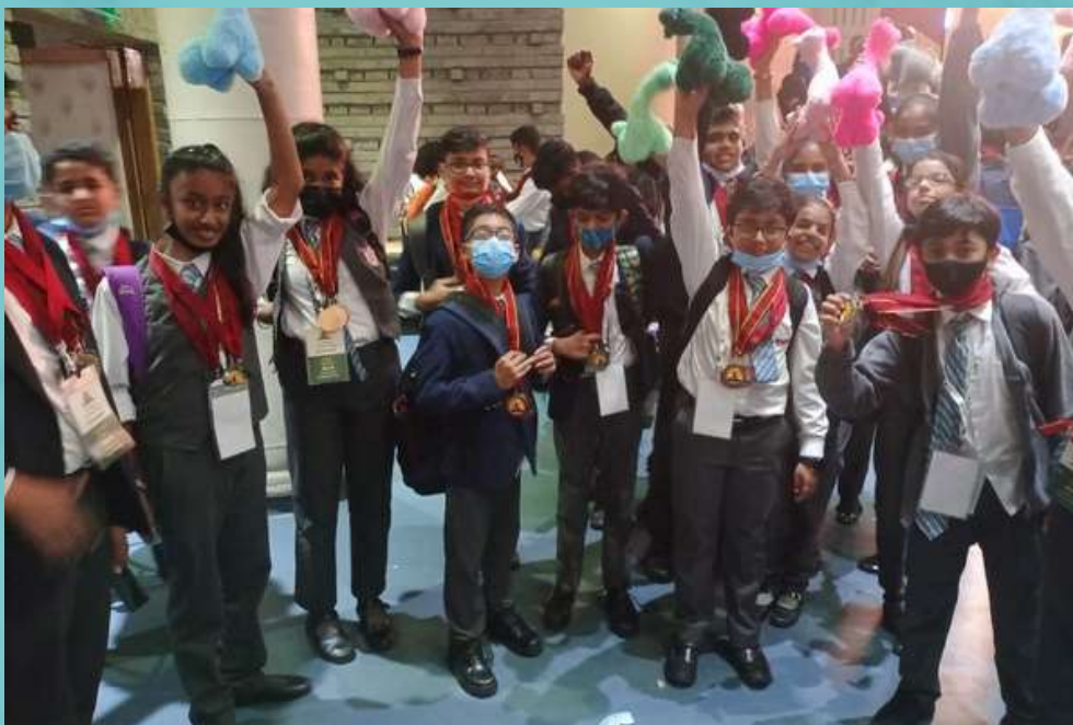
Excited Junior category students showcasing their medals and Alpacas.

World Scholar's Cup is an annual event that is hosted by Light International School, Karen, with the intention of motivating students to be outstanding leaders who are creative and critical thinkers. . This Year's theme was 'A World Re- renewed.