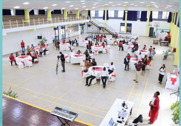
Students and teachers from the Inclusive Education Department celebrate lunch together.

On Friday 18th February, the IED department held their ASDAN Valentines dinner. The event was themed in red black and white colours. ASDAN means Award Scheme Development and Accreditation Network which is a curriculum that is designed to help develop knowledge and on hand skills. It is an effective and vigorous curriculum that allows educators to support learner's meet their individual needs