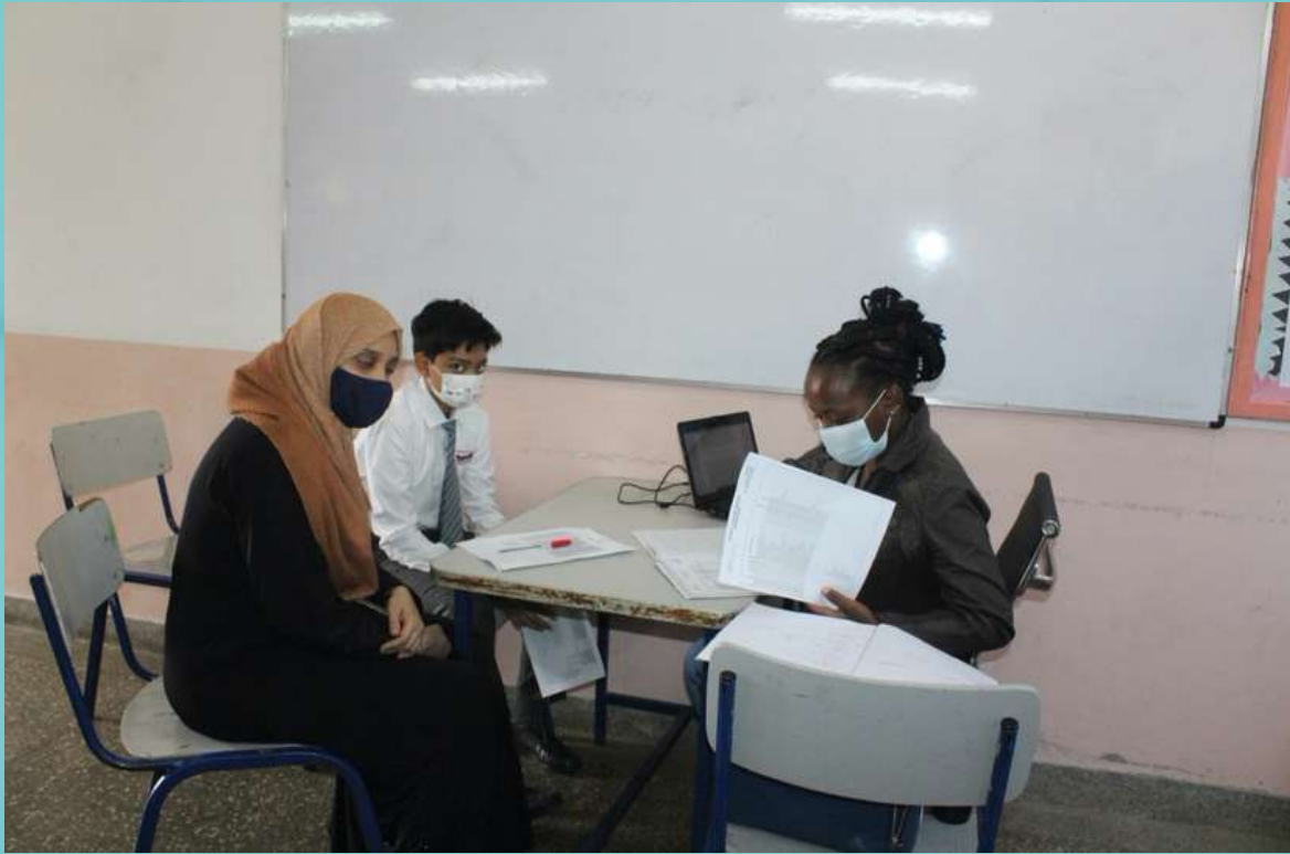
A parent being taken through her child's academic progress during the Year 8 and 7 Parent/Teacher Consultation.

On 5th February, Year Seven and Eight parents, accompanied by learners, engaged individual subject teachers over progressive learner milestones in regard with lessons interactions as well as examination's performance.