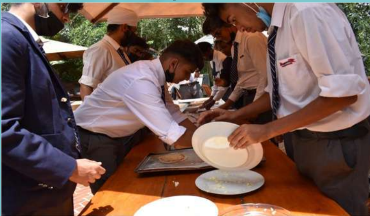
Students' busy making Cheese Pizza at Brown's Cheese Factory, Tigoni

The BTEC Enterprise students visited browns cheese to learn about Enterprises and entrepreneurs, the motivation behind the start up the company 'Cheese' among other areas of business and entrepreneurship