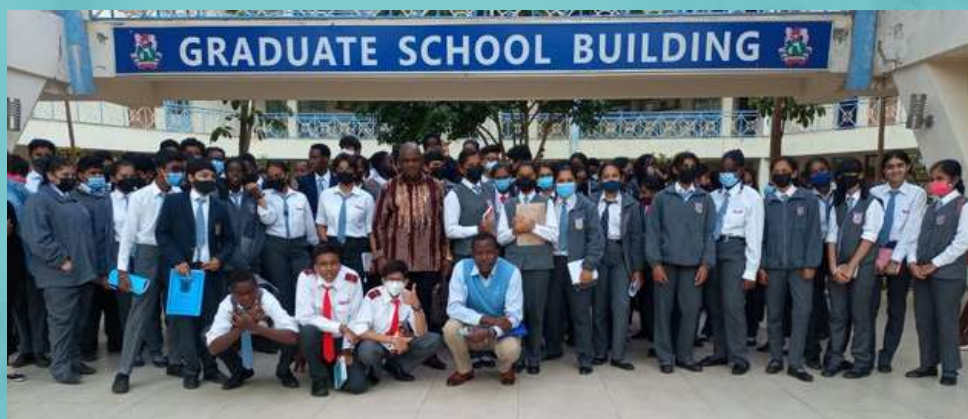
Year 9 students visit to Kenyatta University.

Our Modern Foreign Languages department organises a cultural trip every year in a quest to expose our students to the diverse cultures of the world.