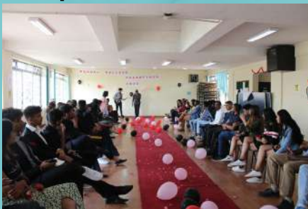
Students during the Mr. and Miss Oshwal College beauty contest

The contest was held alongside the annual valentine's day celebrations which give the students an opportunity to bond and celebrate friendship.