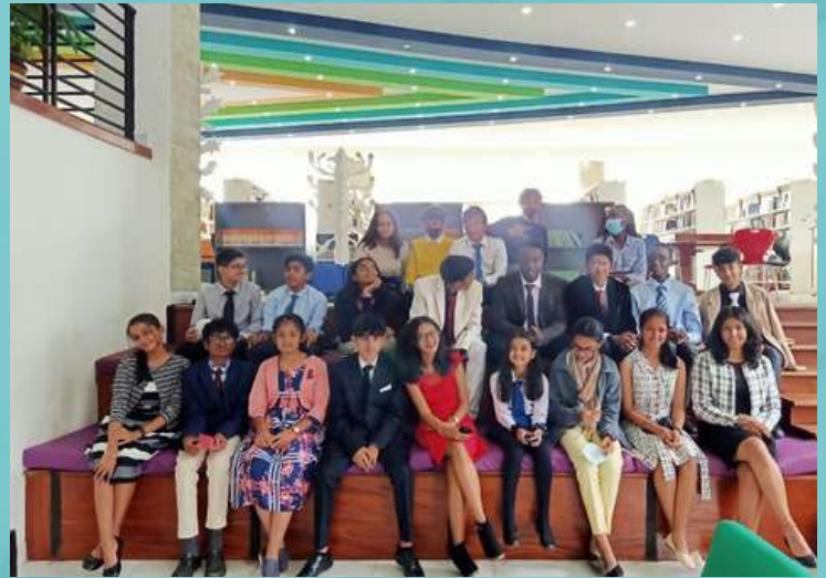
Members of the Model United Nations soon after a session

In the week that was, our students participated in the East African Model United Nations (EAMUN), and gained key skills in diplomacy, negotiations and debating. EAMUN is a replica of United Nations (UN) that enables students across East and Southern Africa to engage in a noble course of making the world a better place.