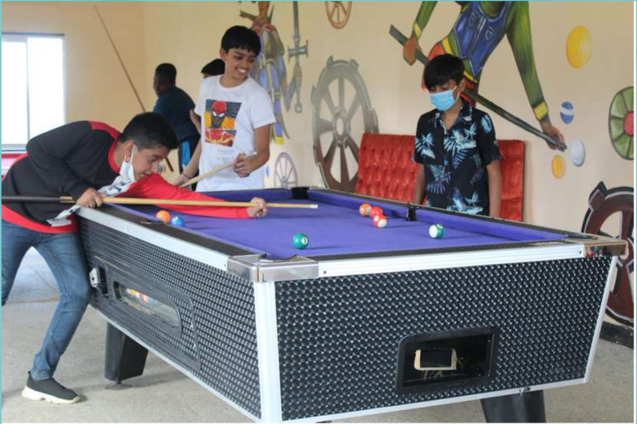
Year 7 and 8 students playing pool at Tafaria Castle.

During the midterm break (12th- 14th February) the Year Sevens and Eights had the opportune chance to visit, stay at and explore the grand Tafaria Castle in Nyeri.