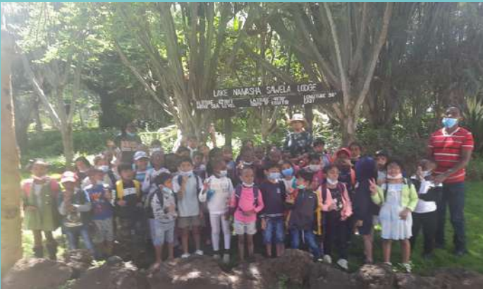
Year 1 learners at Sawela Lodge Trip.

Year 2 - Saturday 12th February to Monday 14th February 2022, Sarova Game Lodge, Nakuru (2nights). They arrived back from the trip on Monday 14th February, 2022