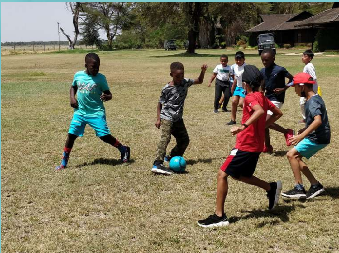
Year 3 learners during Oltukia Trip.