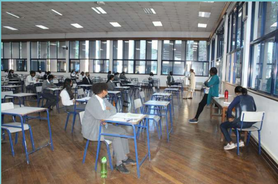
Year eleven students receiving instructions before starting their Mock2 Examination.

The beginning of the year 11 Mock 2 Examination marks the end of our internal examination cycle for our candidate class. These all-important examinations which signal the proximity of IGCSE examinations kicked off on Tuesday 22nd and are bound to run well into next month.