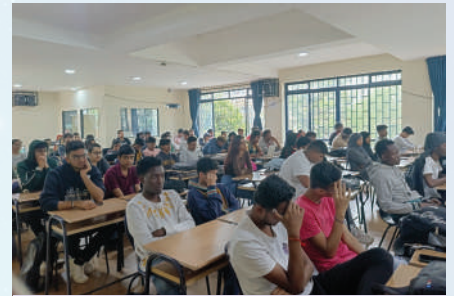
IT students during the mentorship talk