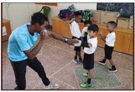
◦ Kickboxing ◦