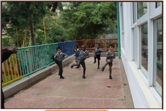
◦ Taekwondo ◦