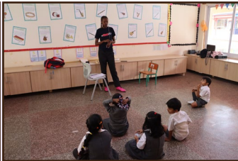
◦ Drama ◦