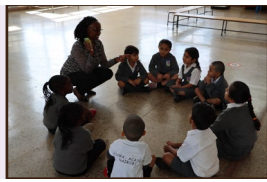
◦ Lamda ◦