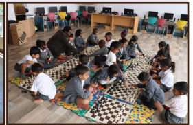
◦ Chess ◦