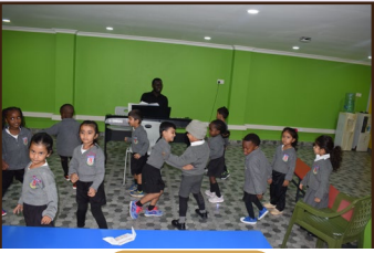
◦ Music ◦