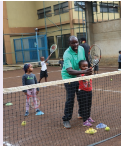
◦ Tennis ◦