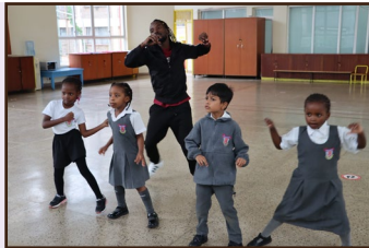
◦ Dance ◦