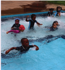
◦ Swimming ◦