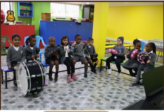
◦ Percussion ◦