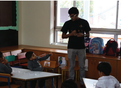
◦ Stem ◦