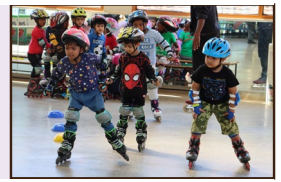
◦ Skating ◦