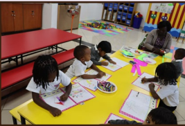
◦ Art ◦