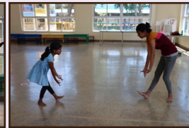
◦ Bharatnatyam ◦