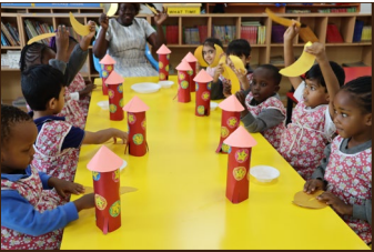
◦ Craft ◦