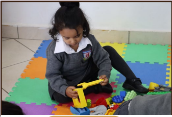
◦ Lego ◦