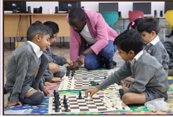
◦ Chess ◦