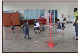
◦ Badminton ◦