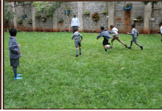
◦ Football ◦