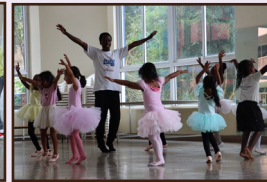
◦ Ballet ◦