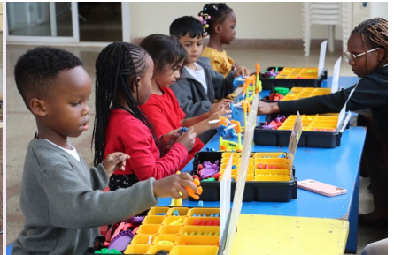
◦ Young Engineer ◦