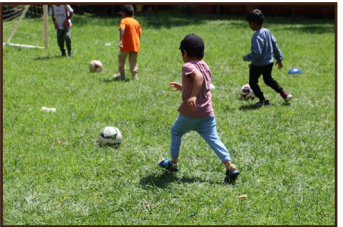
◦ Football ◦