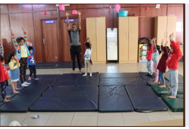
◦ Gymnastics ◦