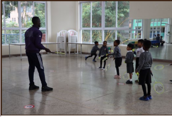
◦ Badminton ◦