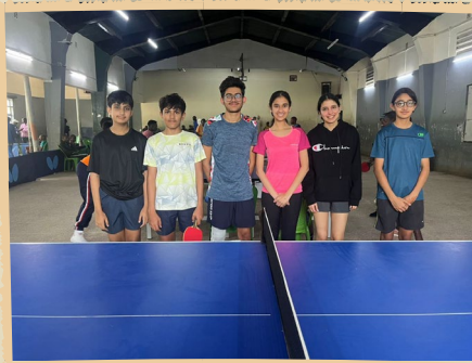
Table Tennis Qualifiers to the Nationals