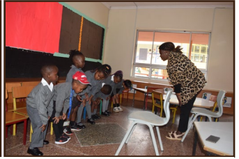
◦ Kiswahili ◦