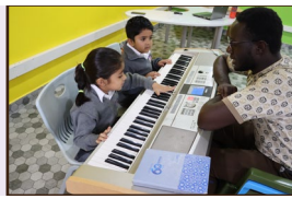
◦ Piano ◦