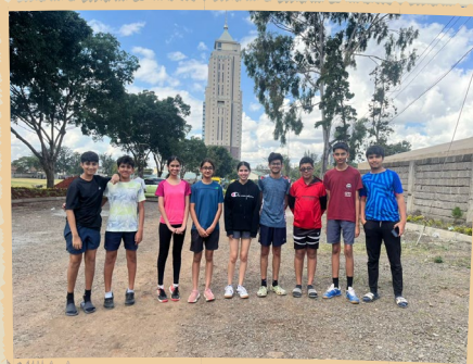
Table Tennis tournament Participants