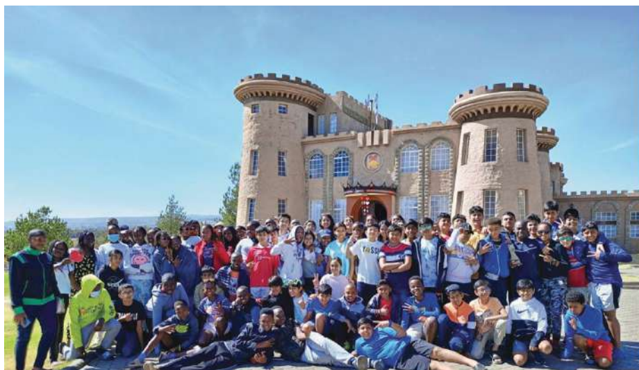
Year 7 students outside the grand Tafari Castle during the go dream programme