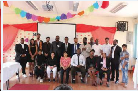
Newly elected Oshwal College Student Association (OCSA) officials in a group photo with College Senior Management team