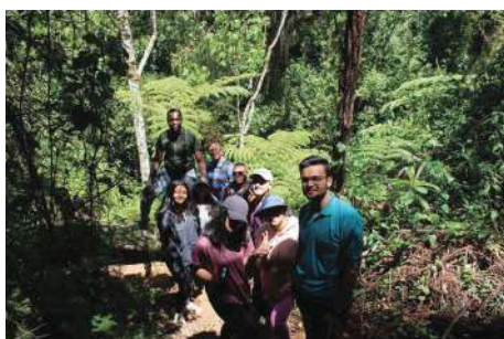
A briefing session by the tour guide

The students took part in zip-lining, horse riding, archery, paint balling and nature walk after which they headed back to College having had a fun-filled trip.