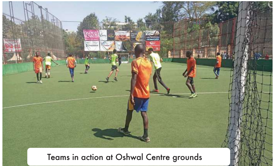
Teams in action at Oshwal Centre grounds

This was a perfect opportunity to nurture and grow local talents. Congratulations to all the participants!