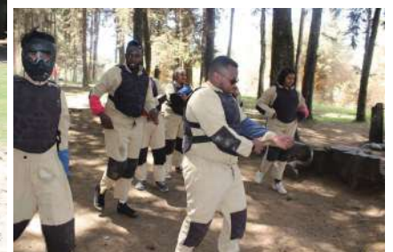
Getting ready for paint balling