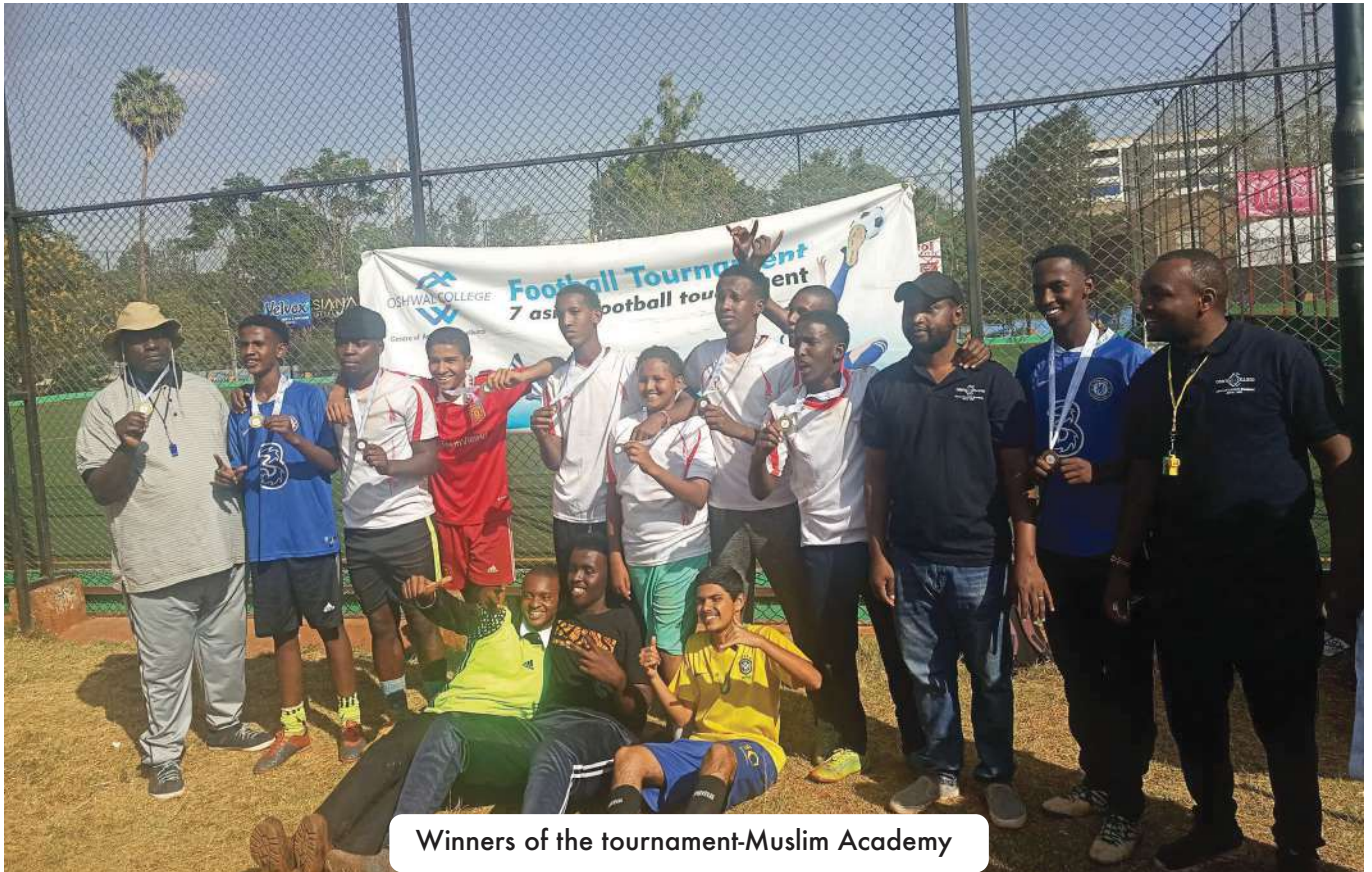
Winners of the tournament-Muslim Academy