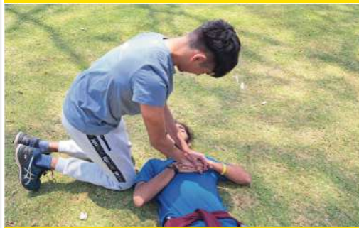
President's Award participants engage in map reading exercise