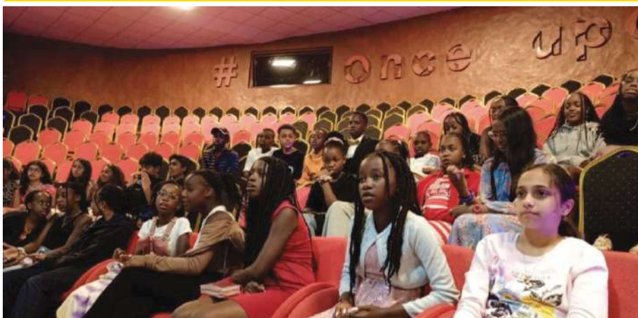
Students reclining to get entertained in the evening after the day's engaging programme

From the feedback gathered so far, the students loved the experience and would like to visit Tafari again.