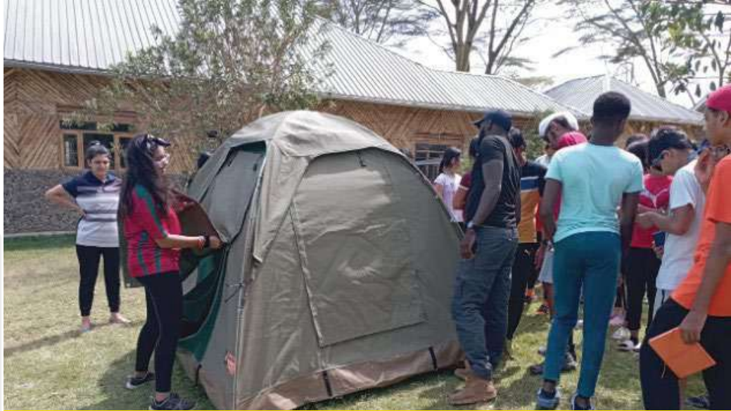
President's Award participants pitching their tents in preparation for a night

The assessors also got a chance to let their hair down after a rigorous training schedule by enjoying a boat ride on the lake. The trip will definitely stay in their memories for a long time.