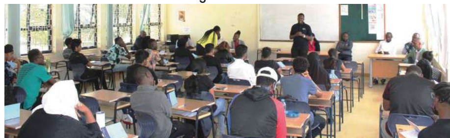
Oshwal College Student Association (OCSA) President addressing the new students