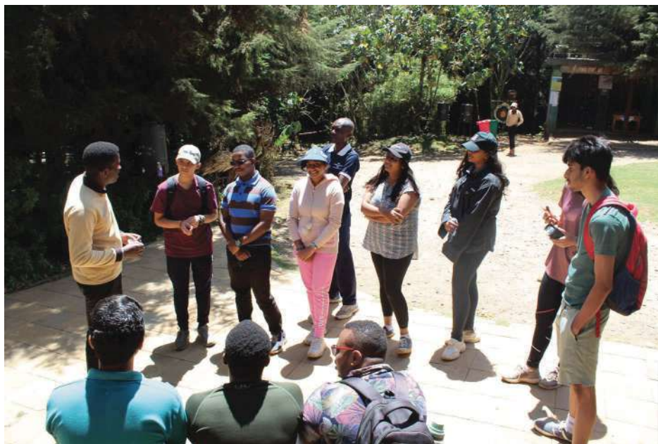
A briefing session by the tour guide