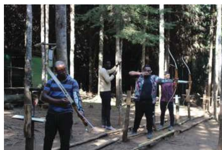
Students participating in archery