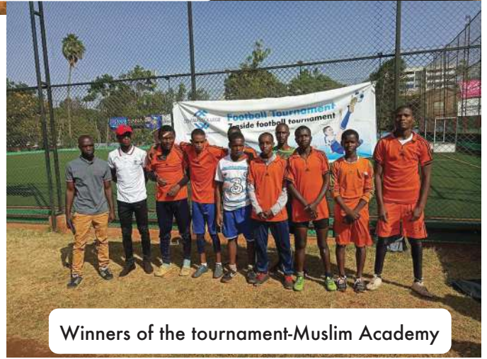
Winners of the tournament-Muslim Academy