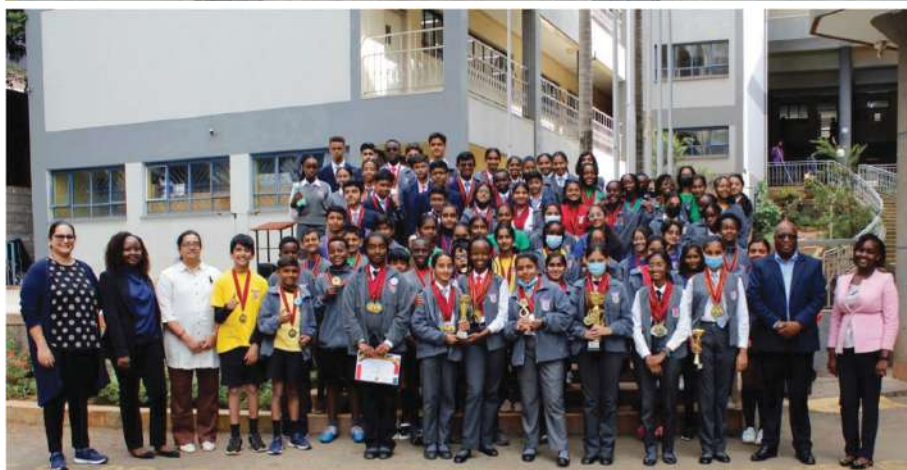
World Scholar's participants pose for a photo together with their medals and trophies