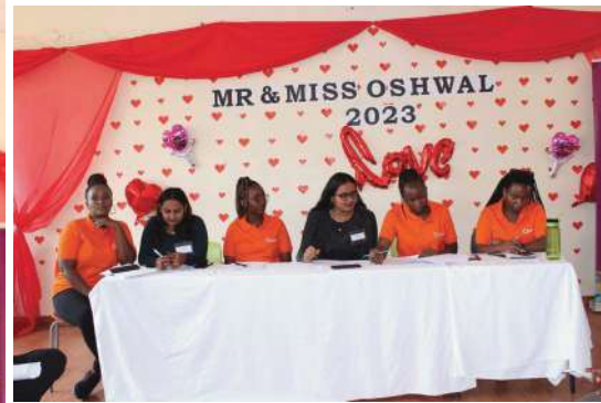
The panel of judges led by team from Qwetu Residences (in Orange)