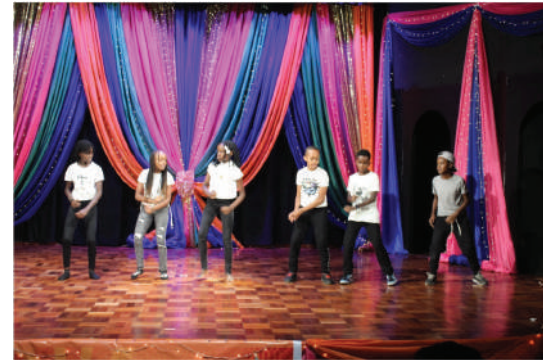
Our students showcased their talent on stage during the Annual Music and Dance Night show

Participants with melodious voices, fascinating costumes, beautiful smiles, and bold moves thrilled the audience. This was truly a memorable evening.