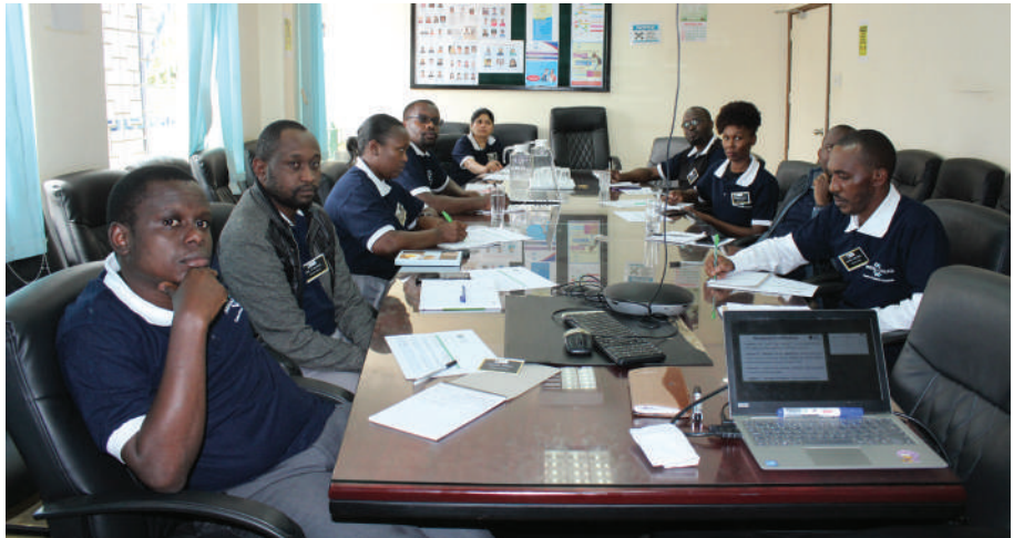
Oshwal College middle level and senior management team during the Management & Supervisory Skills Training