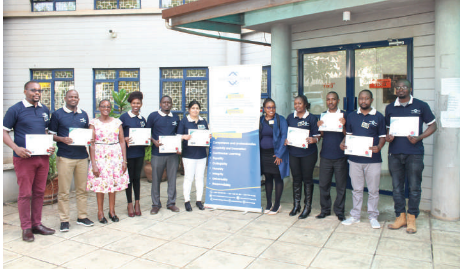
Group photo of Oshwal College middle level and senior management team and IPM trainers

In addition, the training also focused on effective time management, emotional intelligence and performance management.