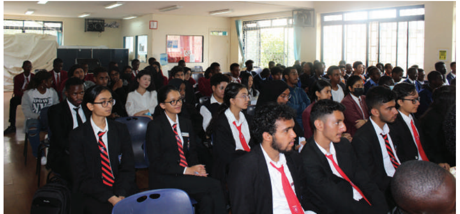
Math's Contest Participants follow the presentations from the Oshwal College Heads of Departments

Congratulations to the winners and all the other participating school!