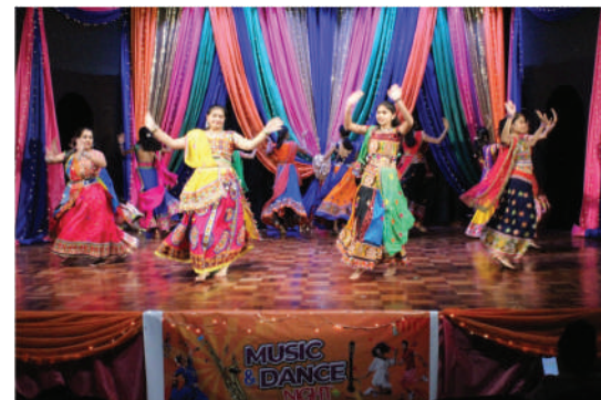
One of the groups showcased their talent on stage during the Annual Music and Dance Night show